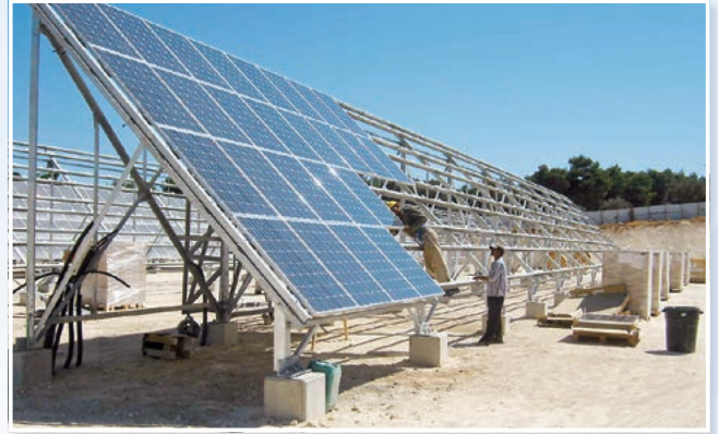
Installation of PV Module