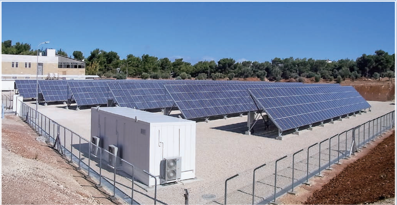
Overall View of the System

PV system brings eco-friendly and sustainable power to the society.